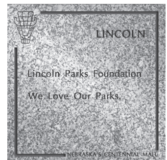
Individual 18" x 18" Tile