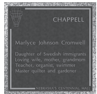
Legacy 18" x 18" Tile

All contributions are tax deductible as allowed by law. Gifts of any size are appreciated.